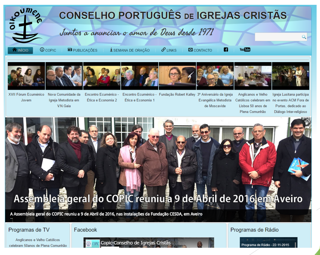
photo of the General Assembly of the COPIC held on April 9, 2016, was admitted the German Evangelical Church of Porto as associate member of COPIC